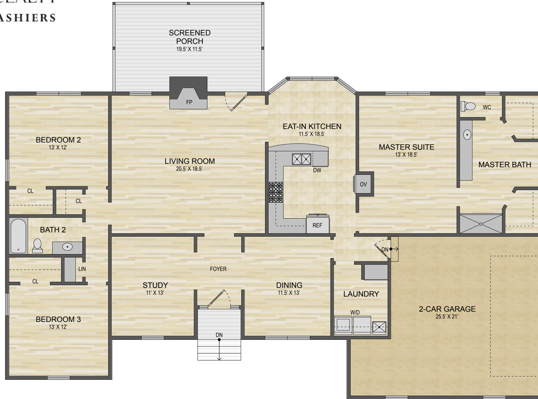
Main Level Floor Plan