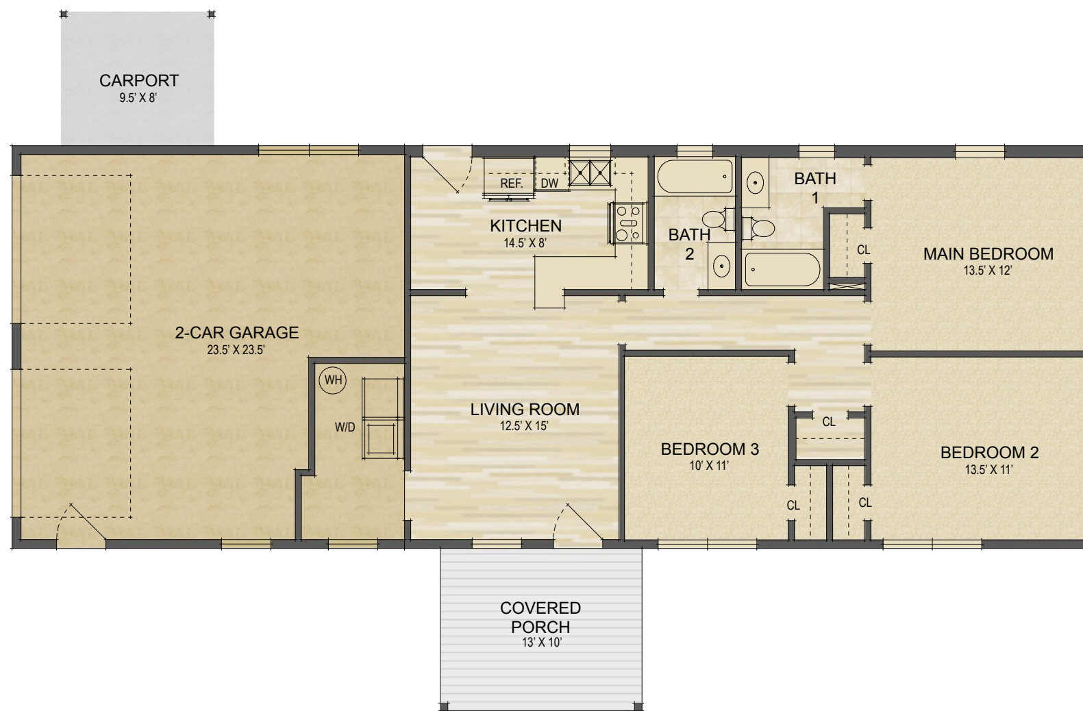
Guest House Level Floor Plan