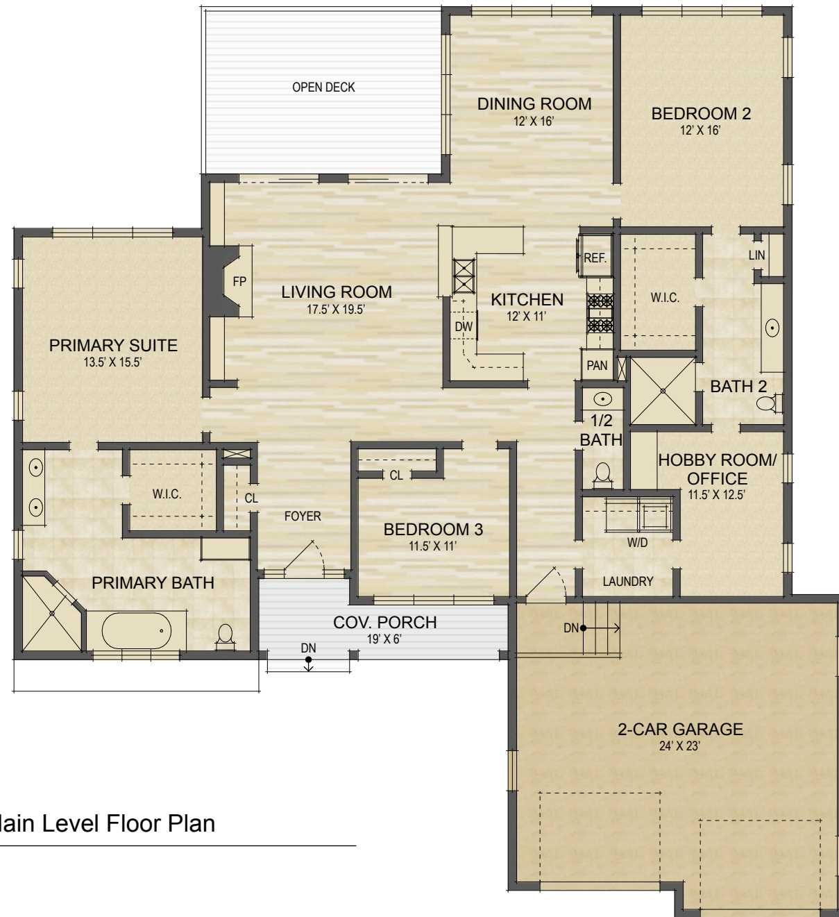
Main Level Floor Plan