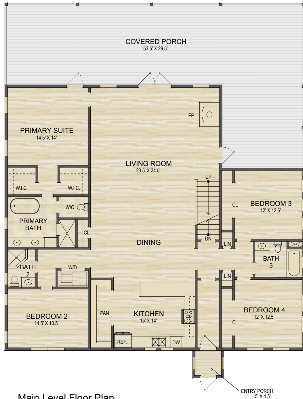
Main Level Floor Plan