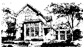
Laurel – Historic Charleston Inspired – 1,900 sq. ft.