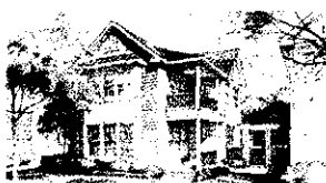
Ashworth – Historic Charleston Inspired – 1,980 sq. ft.

NOTE: Declarant, at anytime may add to or eliminate home designs for Cadence Point at their sole discretion, so long as they own Lots in Cadence Point.