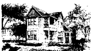
Grove – Historic Charleston Inspired – 1,765 sq. ft.