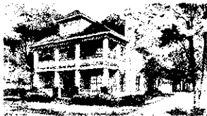
Franklin – American Foursquare – 2,150 sq. ft.