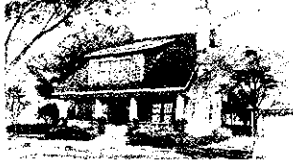
Maple - Craftsman bungalow style – 2,225 sq. ft.