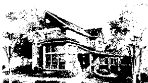
Parkview – Historic Charleston Inspired – 1,685 sq. ft.