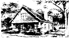
Dogwood – Craftsman bungalow style – 2,500 sq. ft.